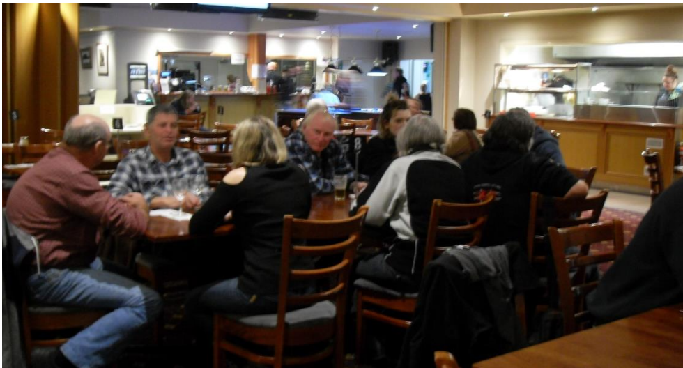
A pleasant evening at the Hiberian

Saturday night saw us all at the Hiberian for dinner. Great food and company, what better way to finish off a fantastic day.