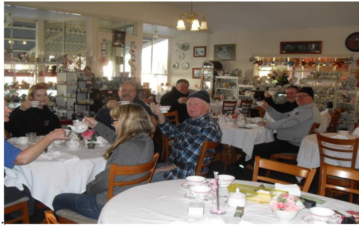
This is how real men have breakfast.

The morning was brisk (about 7 degrees) but not a cloud in the sky and the sun was smiling down at us. After a decent breakfast in the tea room just up from the motel we were ready for a ride.