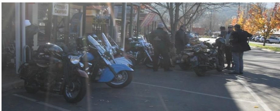
Sunny Bright, no rain, not a cloud in the sky – perfect.

We stopped in Bright for lunch, due to variety of eateries members scattered in all directions to find a venue suitable for their tastes. Some thought a good old pie and sauce followed by a vanilla slice was the best way to feed the man.